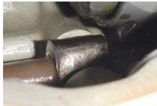
A severely spalled cam lobe. This camshaft failure originated from corrosion pitting during an eight-month period of engine disuse.

Piston and ring failures can cause catastrophic engine failures, usually involving only partial power loss but occasionally total power loss. Piston and ring failures are of two types: 1) infant-mortality failures due to improper manufacture or installation; and 2) heat-distress failures caused by pre-ignition or destructive detonation events. Heat distress failures can be caused by contaminated fuel or improper engine operation, but they are generally unrelated to hours or years since overhaul. A digital engine monitor can usually detect pre-ignition or destructive detonation episodes, allowing the pilot to take corrective action before heat-distress damage occurs.